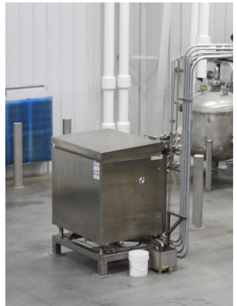
LARGE SCALE HI-PRESSURE